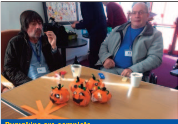
Pumpkins are complete